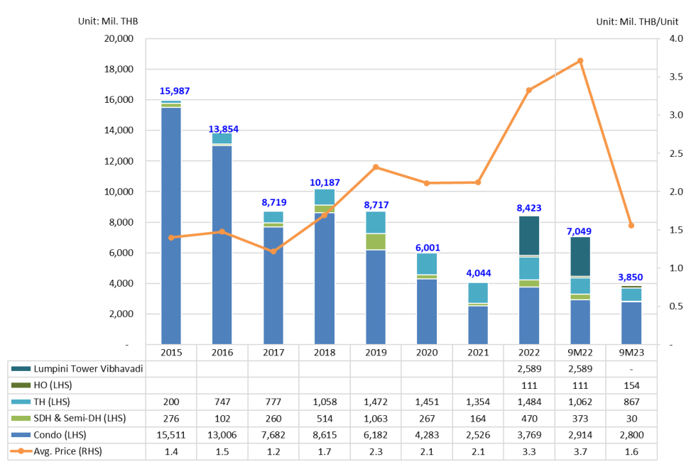
Chart 3: Residential Sales