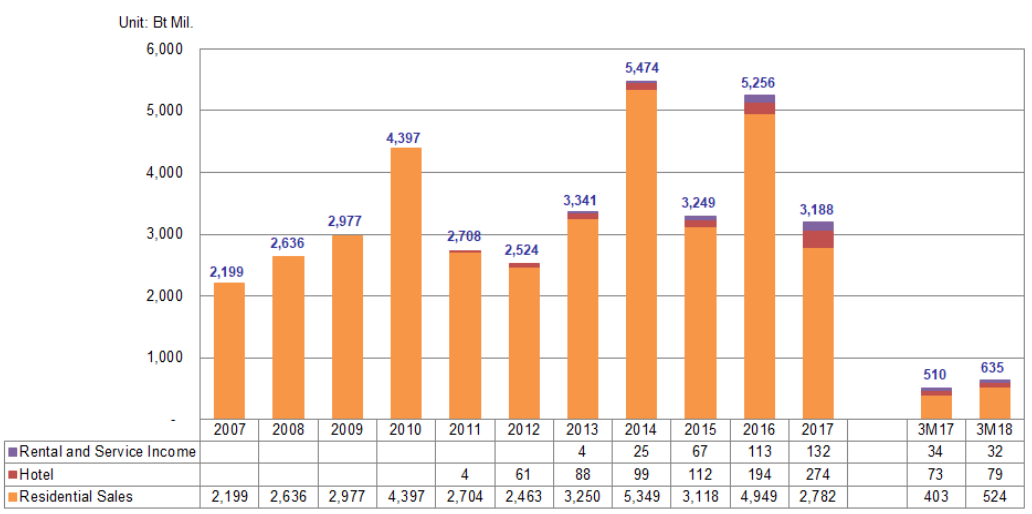
Chart 2: Revenue Breakdown by Segment